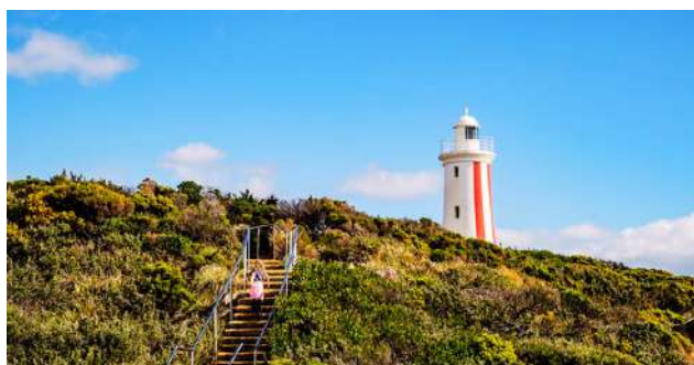
Mersey Bluff Lighthouse, S. Group