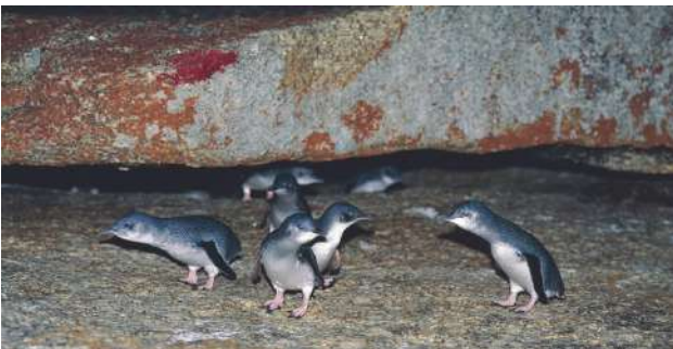
Fairy Penguins