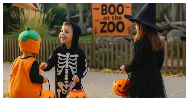
BOO at the ZOO, Hobart Zoo and Aquarium