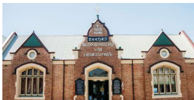
West Coast Heritage Centre, Tourism Australia