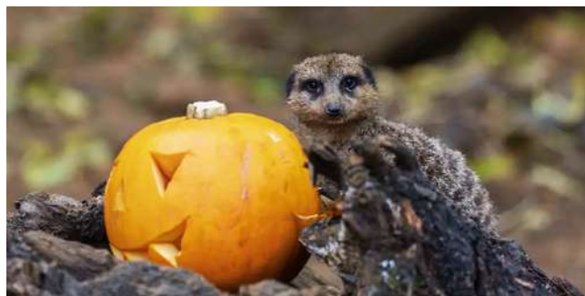
BOO at the ZOO, Hobart Zoo and Aquarium

Reminder: Tasmania's weather and wildlife both like to keep travellers on their toes. The conditions can shift quickly — from sunshine to fog or drizzle within hours so always pack layers and keep waterproof gear in your campervan. And as you explore, stay alert for wallabies, wombats, and possums on rural and coastal roads, especially at dawn and dusk. Slowing down not only keeps you safe but helps protect Tasmania's incredible wildlife!