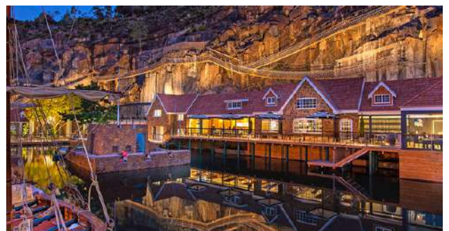
Penny Royal Launceston, robburnettimages