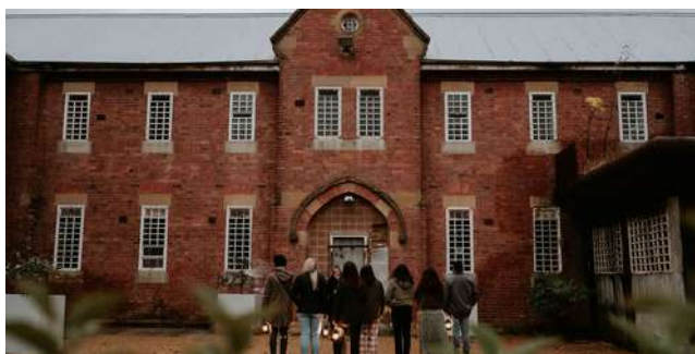
Gaiety Theatre, After Dark Tours