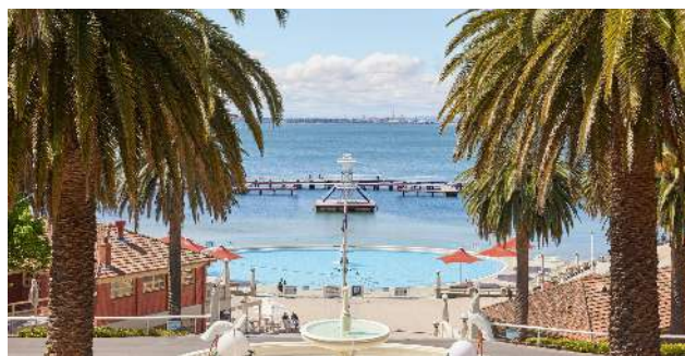
Geelong Foreshore

Reminder: Victoria's regional towns and roads have plenty of nocturnal wildlife. We recommend that you don't drive at night. This is for your own safety, to prevent injuring any wildlife, and to avoid any damage to your campervan rental.