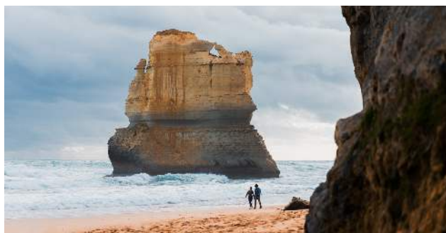
12 Apostles